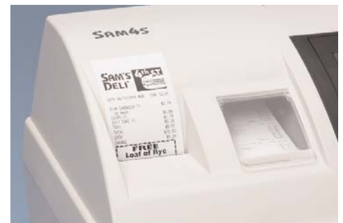
Quick and Easy Drop and Print Paper Loading

All product features are subject to change without notice.