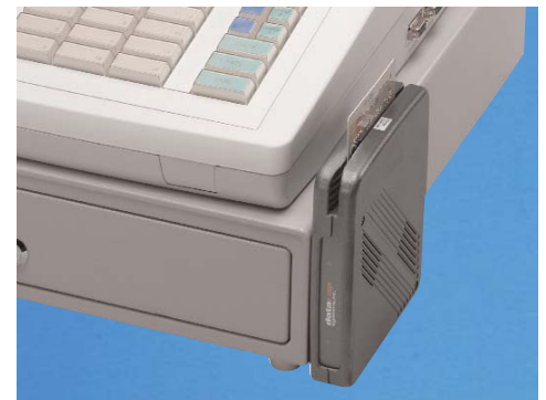
DataTran™ Integrated Credit Option