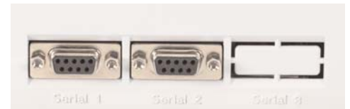
Two Standard RS-232C Ports